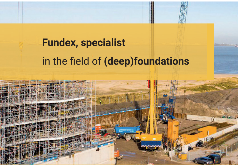
Installation of the Fundex Energy Piles, Pharos Breskens

Fundex, specialist in the field of (deep)foundations